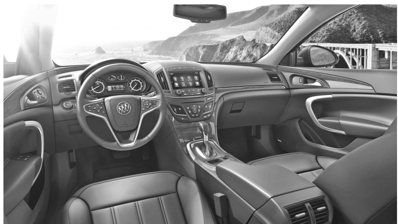
2014 Buick Regal interior with saddle seating, cocoa accents, offered with two-tone Soleil Keisel leather seats and Rhythm wood décor. "