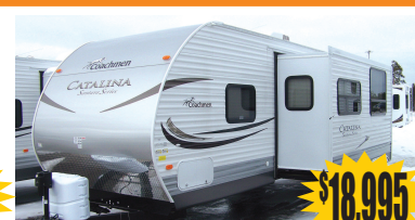
2013 CATALINA 2920BCK TRAVEL TRAILER. This is a great family unit. It will sleep 11 people and the family pet. It comes equipped with Bazinga Stone decor, Custom Premier Package, 13.5 BTU A/C, 3 burner stove with oven, outside marine grade speakers, and even the power package. MSRP: $26085.50. Sale Price only $18,995