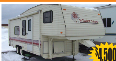
1992 WILDERNESS 5TH WHEEL Rear bathroom model. This offers more room in the lavatory and a bigger shower tub. It has no slides, a jack knife sofa and a fold down dinette. It offers a queen bed and is wired with an audio system. Sale Price - $4,500.

TURN NORTH AT MEECHER ROAD (TRAFFIC SIGNAL BY WALGREENS ON M-32 WEST) - NORTH 2 BLOCKS TO EXPRESSWAY COURT OPEN MON - SAT: 9AM - 5PM