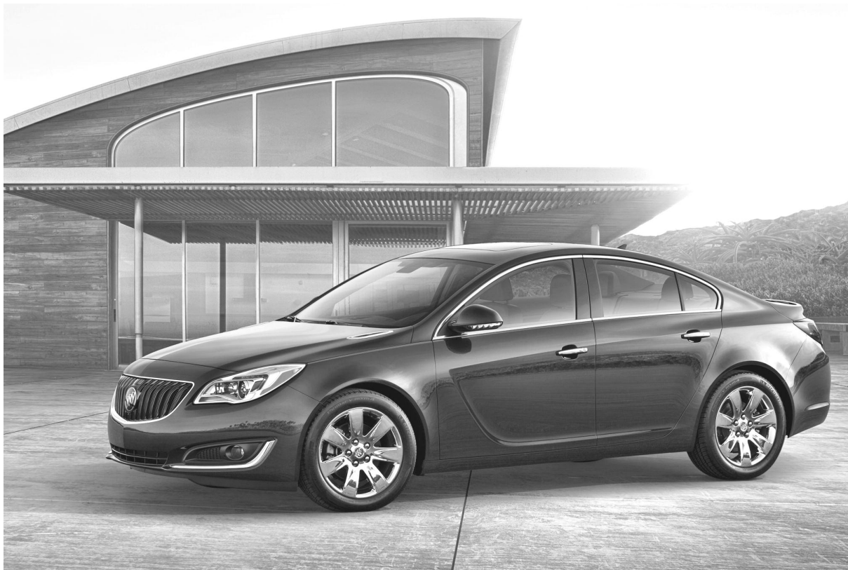
2014 Buick Regal Turbo side view with Graphite Blue Metallic exterior color and 18-inch chrome wheels."